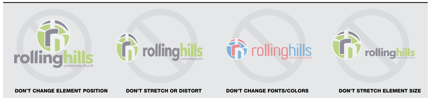
DON'T CHANGE ELEMENT POSITION